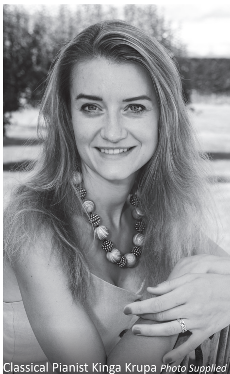
Classical Pianist Kinga Krupa