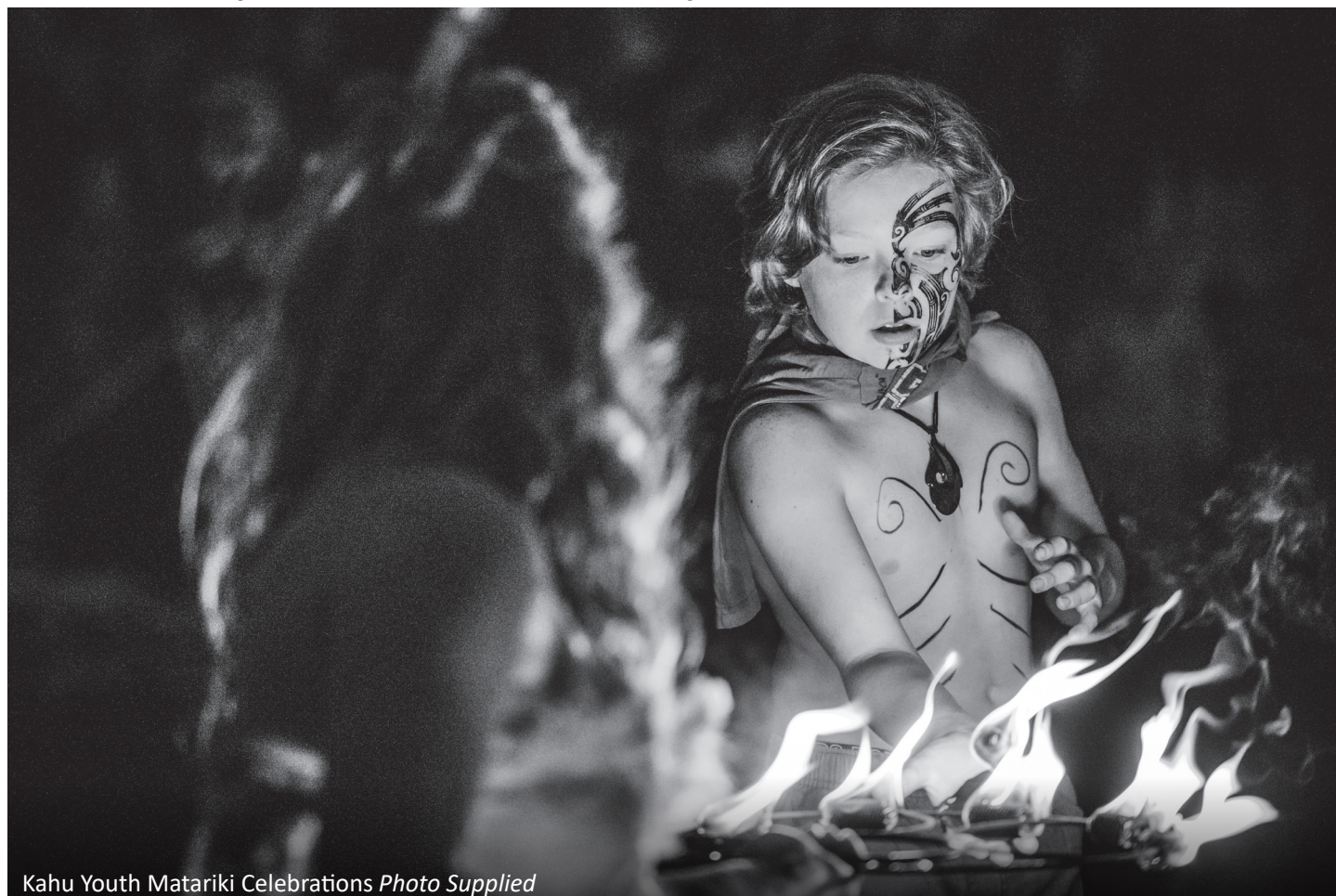
Kahu Youth Matariki Celebrations

The first official public holiday will be held for Matariki on Friday, 24 June this year. The date will shift each year to align with the Maori lunar calendar