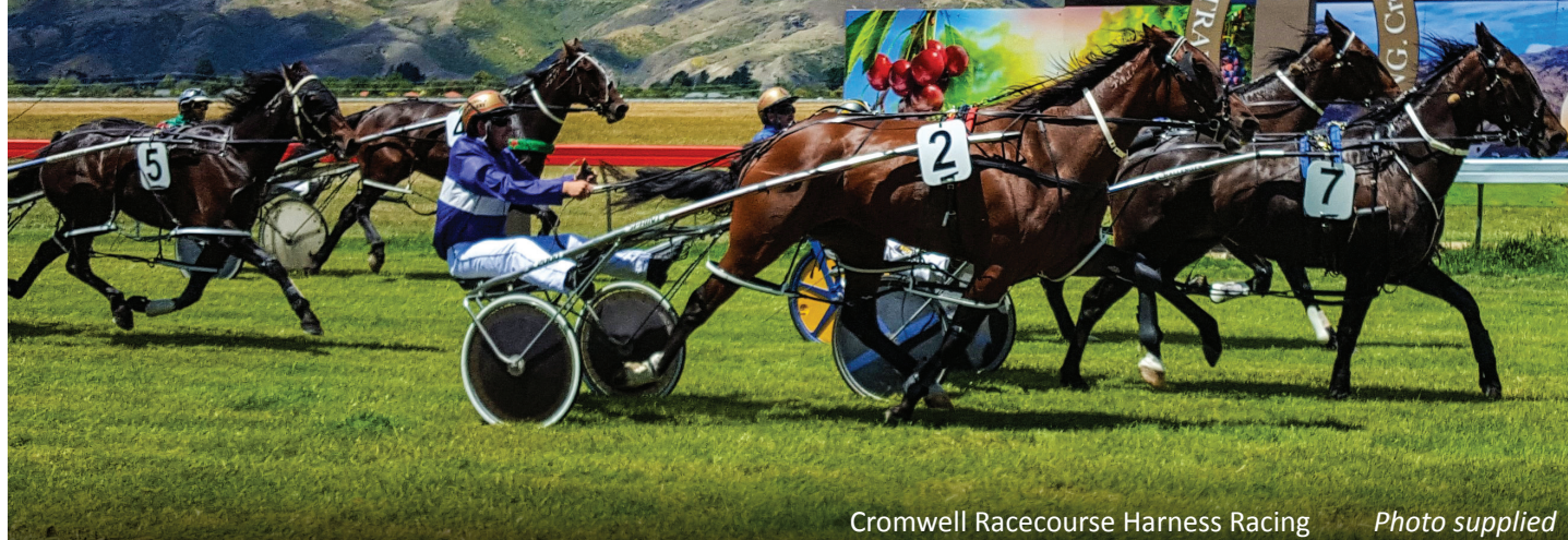
Cromwell Racecourse Harness Racing