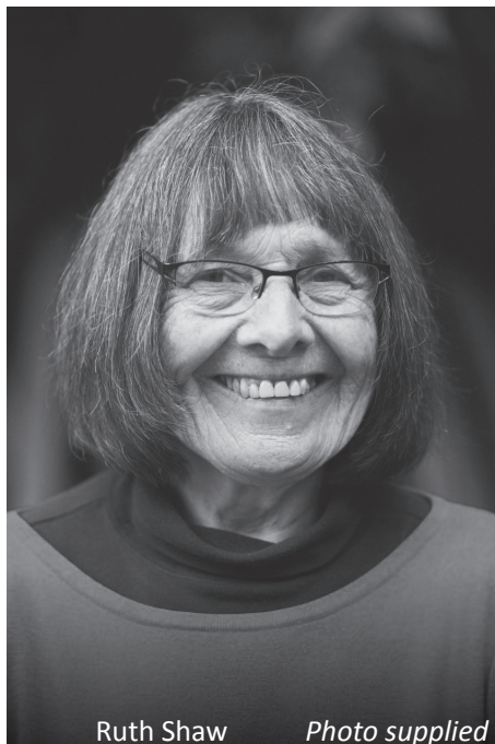
Ruth Shaw Photo supplied