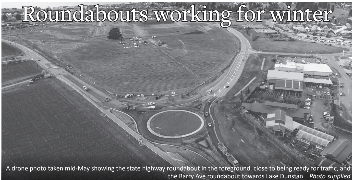
A drone photo taken mid-May showing the state highway roundabout in the foreground, close to being ready for traffic, and the Barry Ave roundabout towards Lake Dunstan