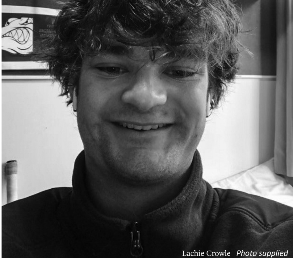
Lachie Crowle Photo supplied